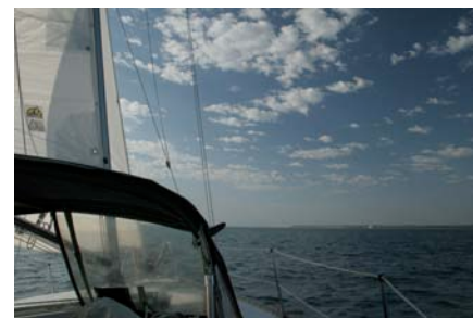
Off of South Milwaukee