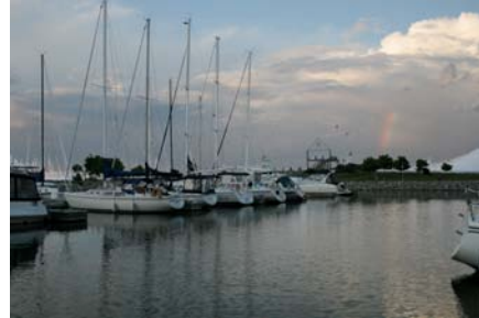
Reef Point Rainbow